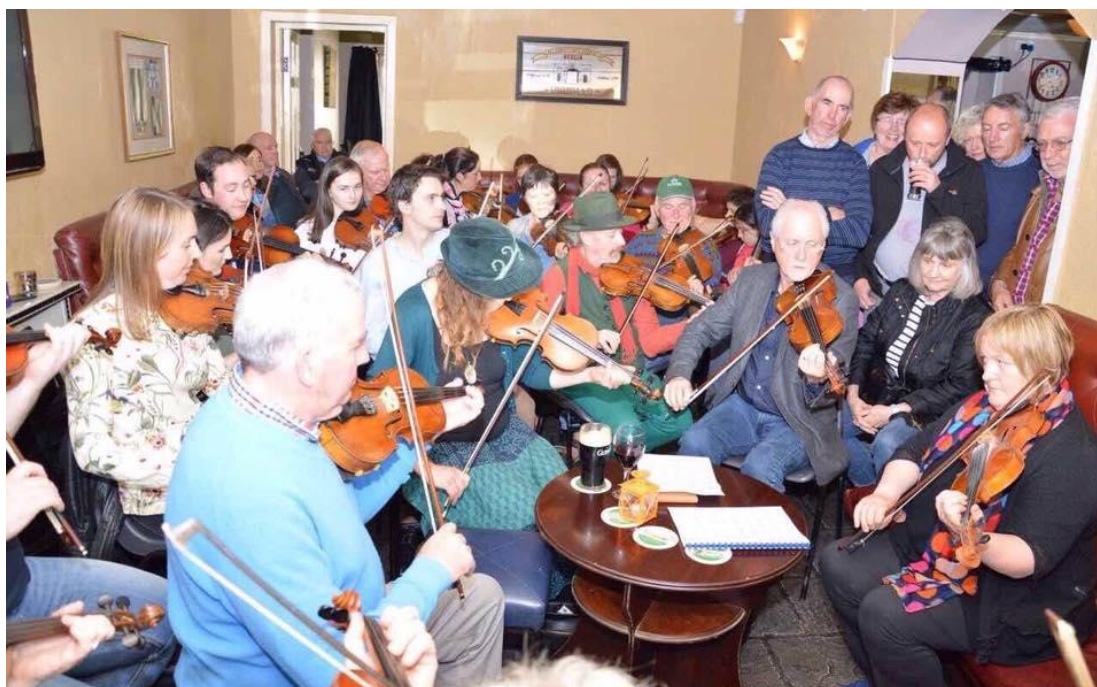
The 2016 Fiddle Recital in Lyon's bar – be sure to take your seat in good time!

Soundcloud link: https://soundcloud.com/1scartaglin/didnt-she-dance-murphys-tadgh