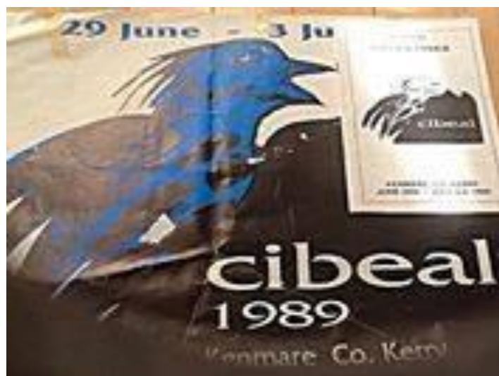
Posters from the Cibeal arts festival in Kenmare