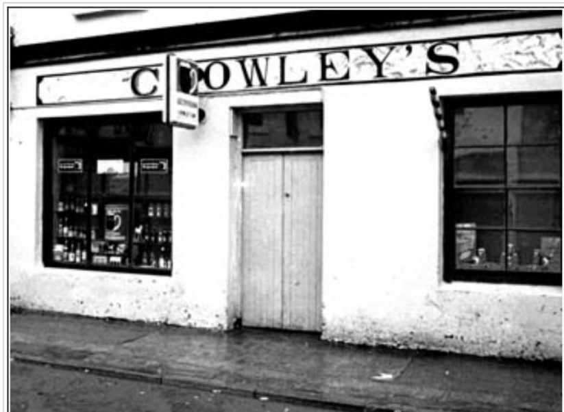
Crowley's Bar, Kenmare, in the 1980s: location of the session.

Transcriptions and text © Paul de Grae 2018.