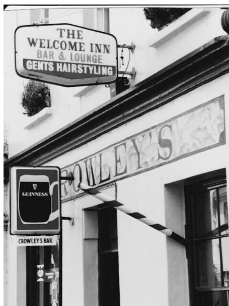
Crowley's Bar, Kenmare.